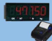
HH™ Series Weighing Indicators