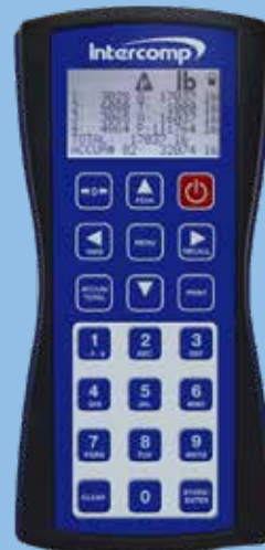
HH400™ (IWH) RFX® Indicator (Optional Accessory)

info@intercompcompany.com Worldwide: +1 763-476-2531 Toll Free: 800-328-3336